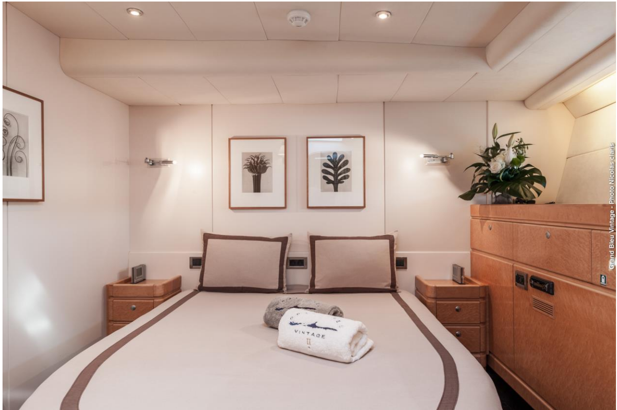
Grand Bleu Vintage