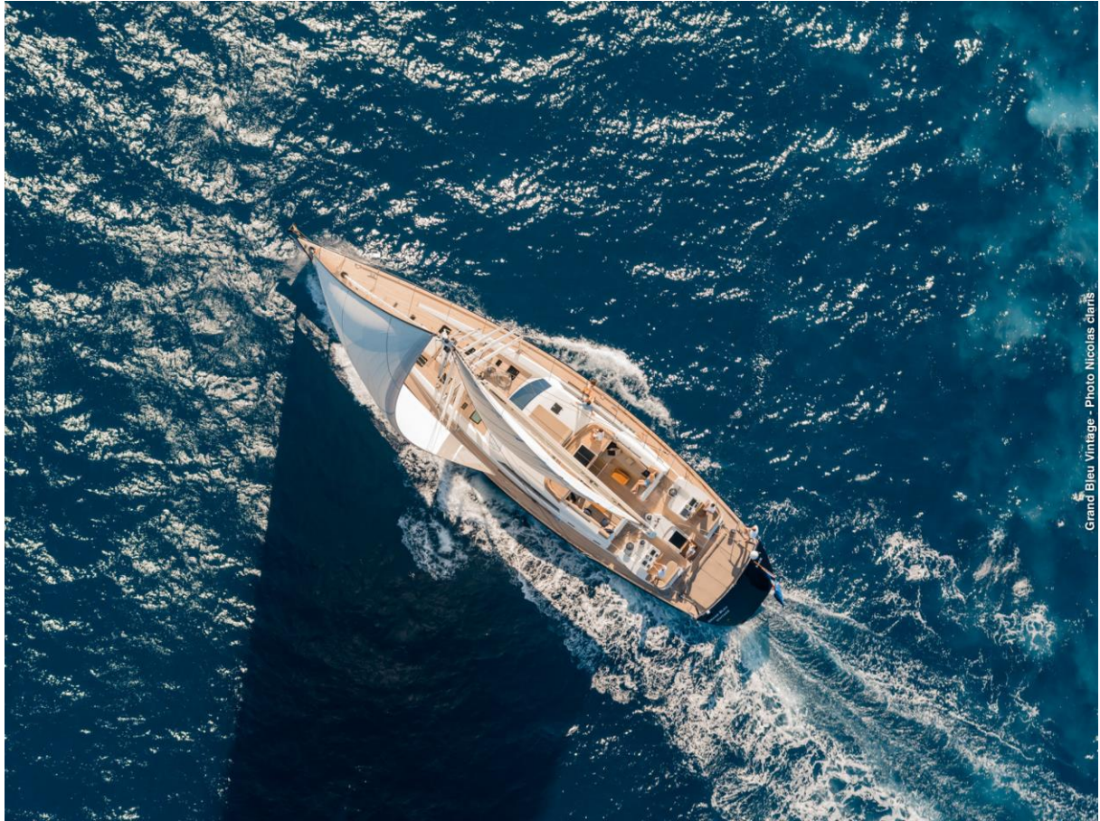
Grand Bleu Vintage