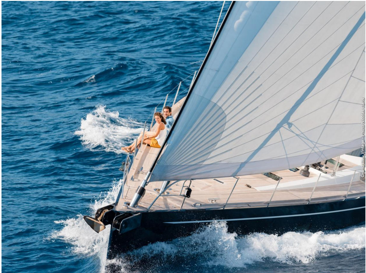
Grand Bleu Vintage