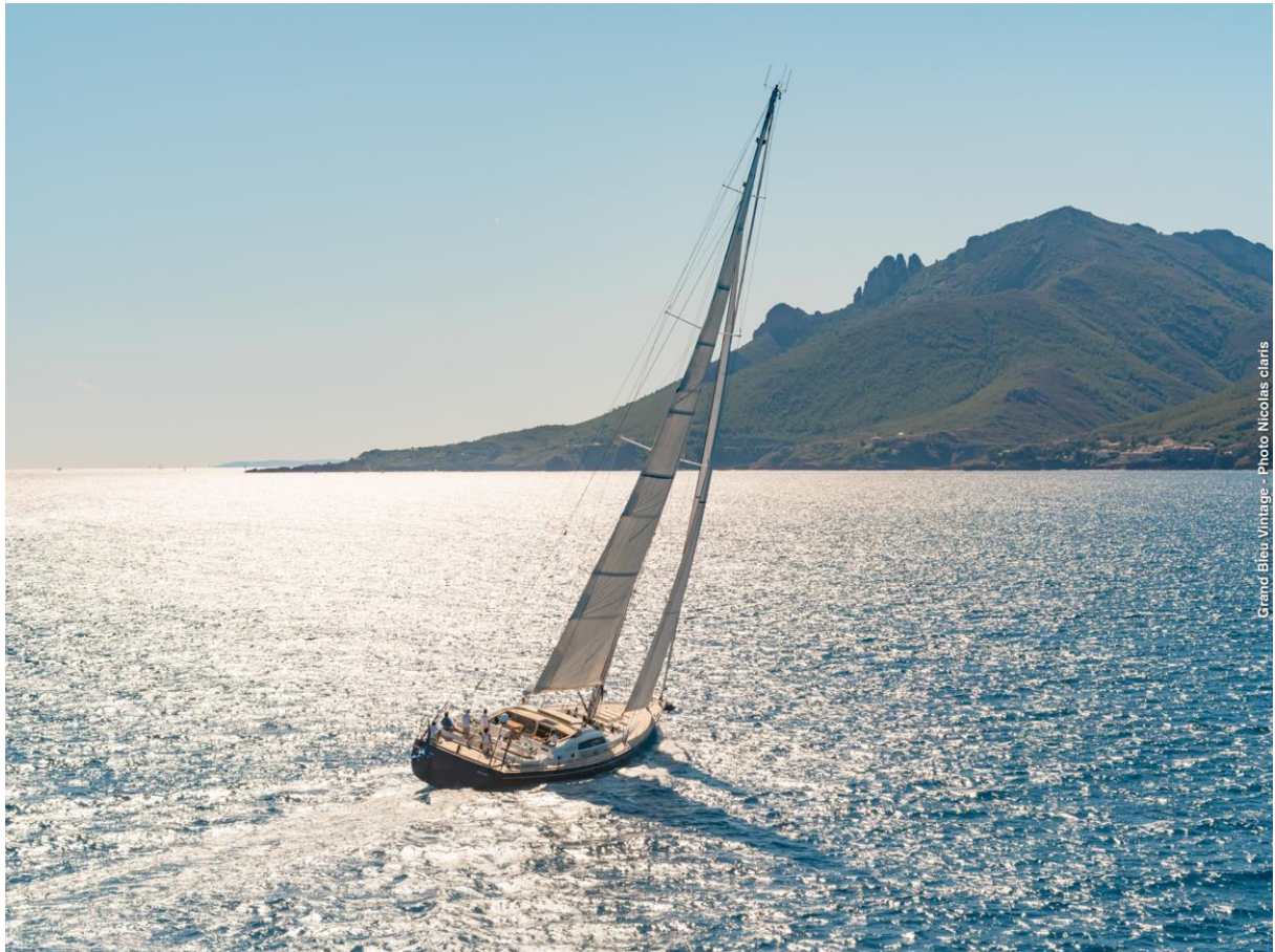
Grand Bleu Vintage