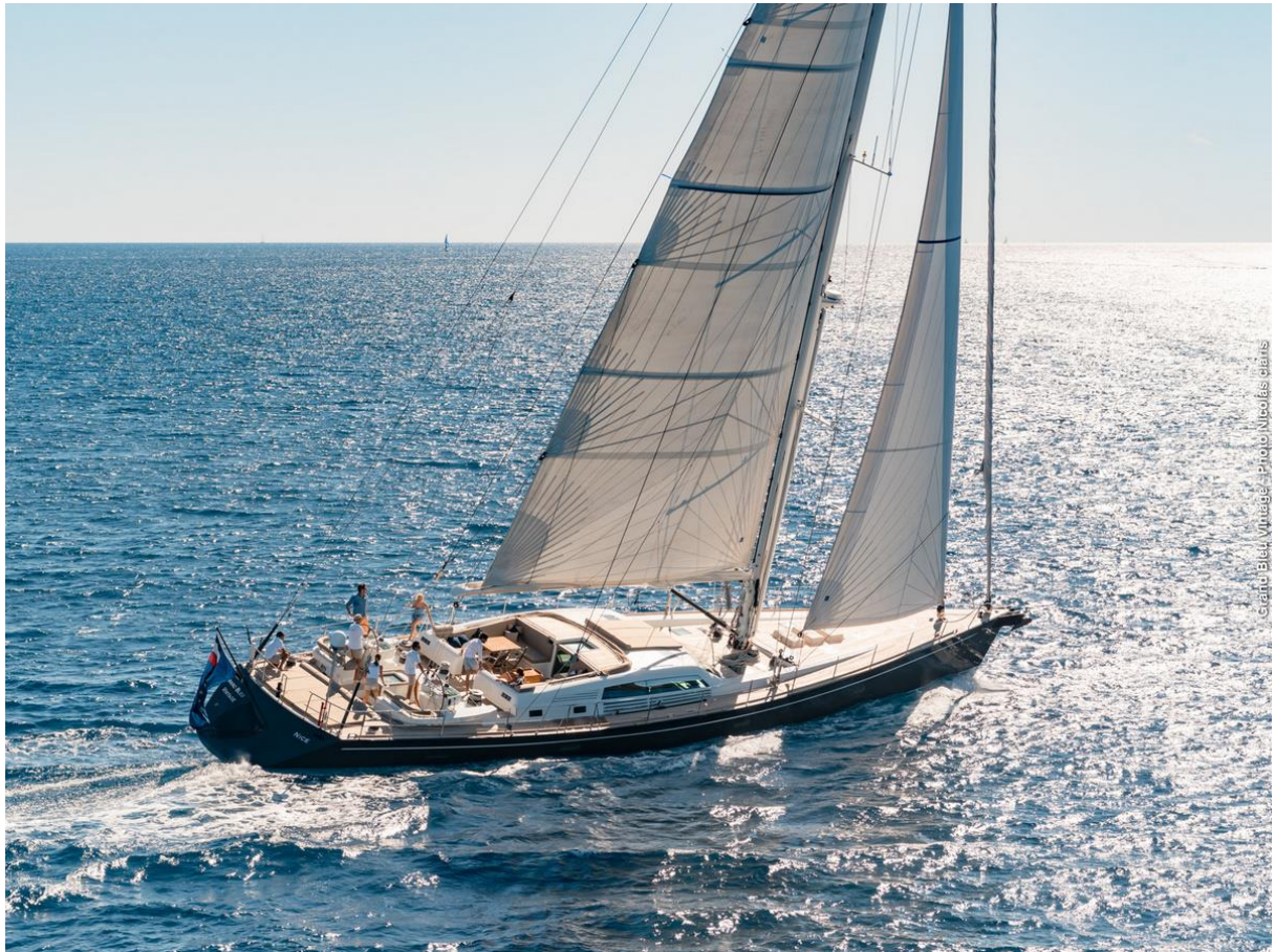
Grand Bleu Vintage