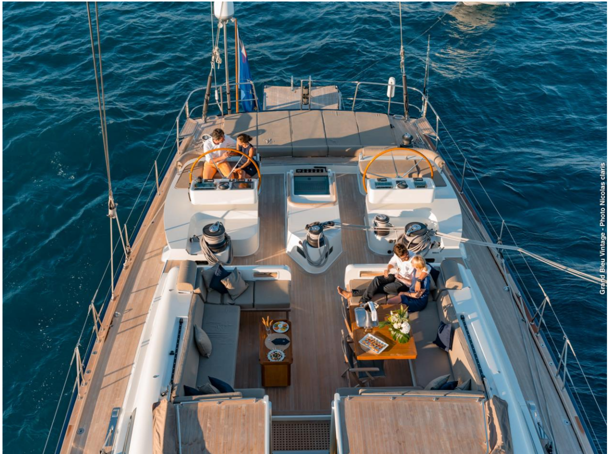
Grand Bleu Vintage