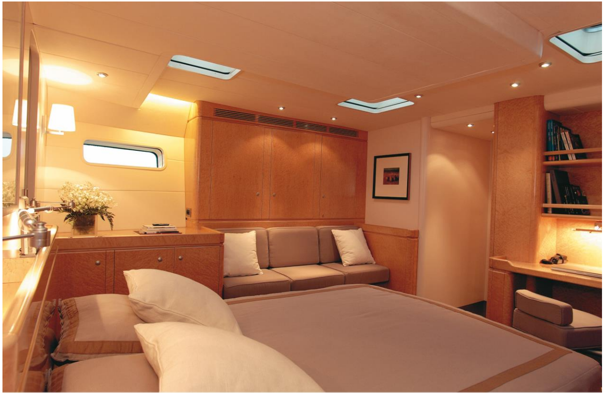
CNB - Grand Bleu Vintage