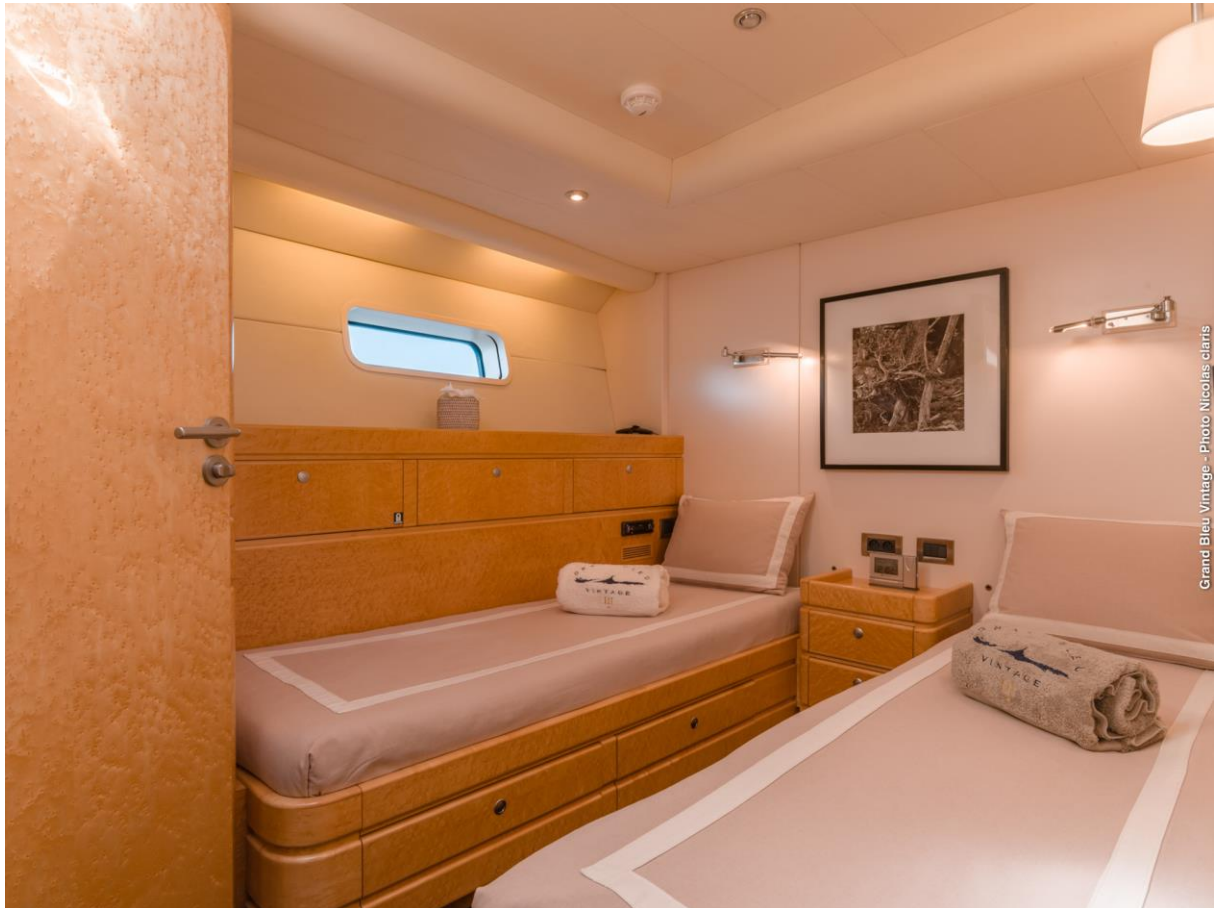
Grand Bleu Vintage - Photo Nicolas clairs