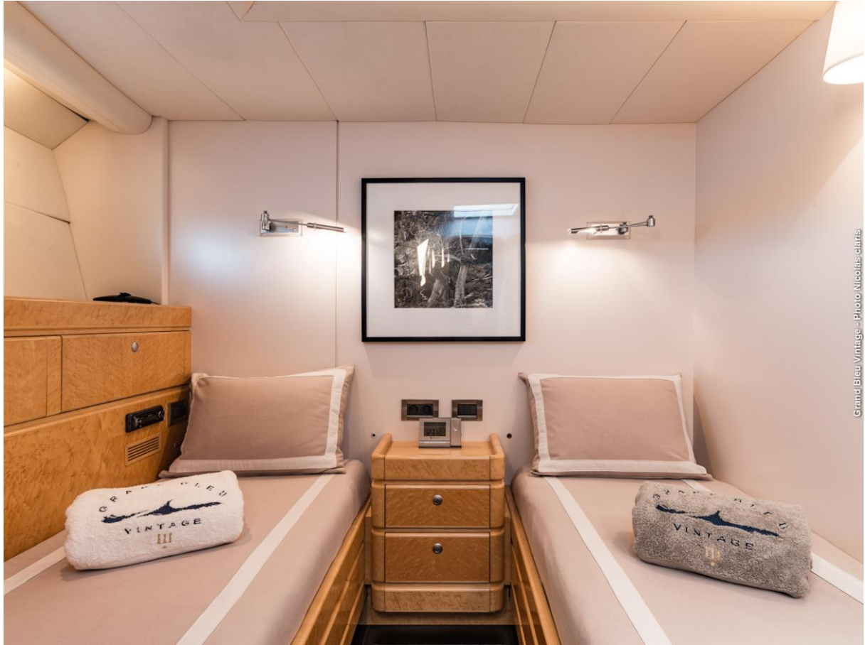
Grand Bleu Vintage