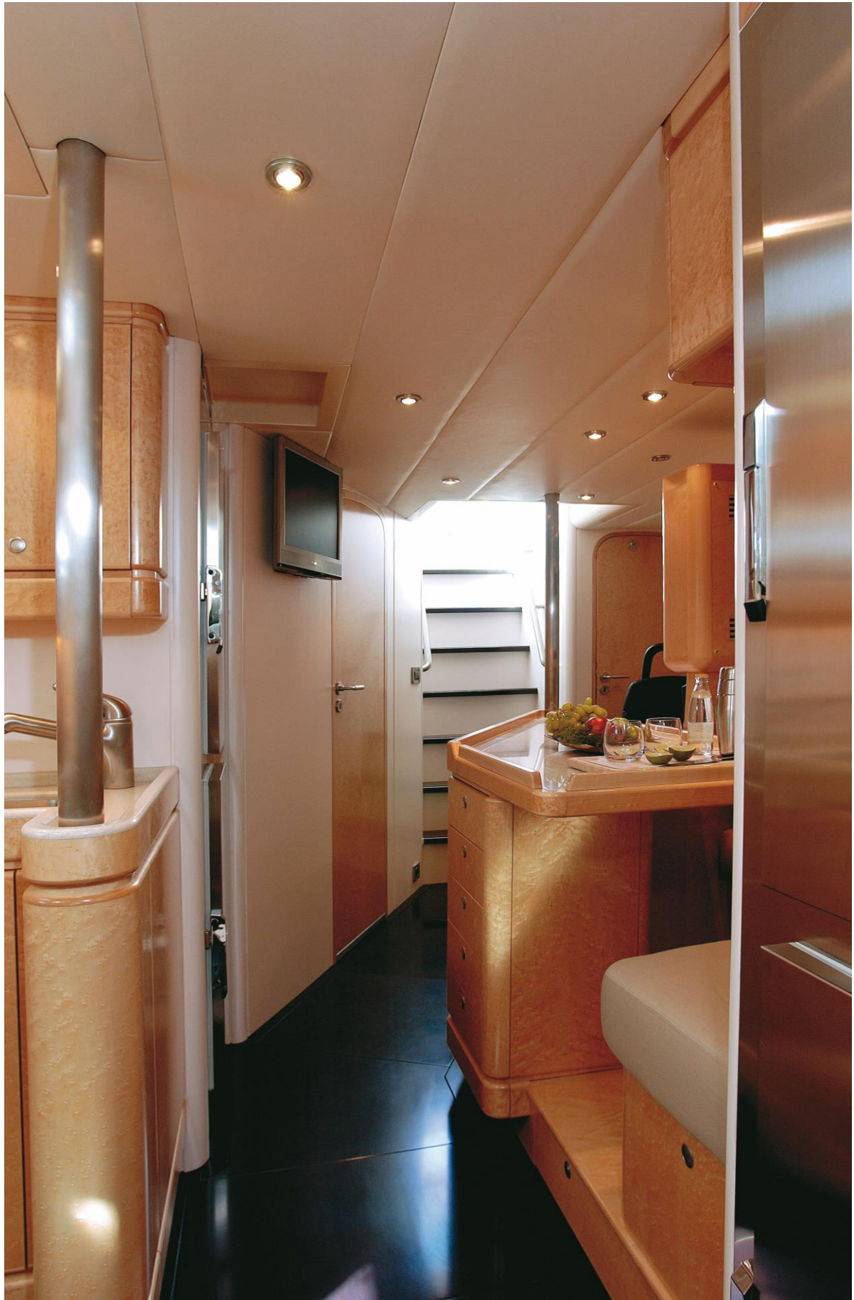
CNB - Grand Bleu Vintage