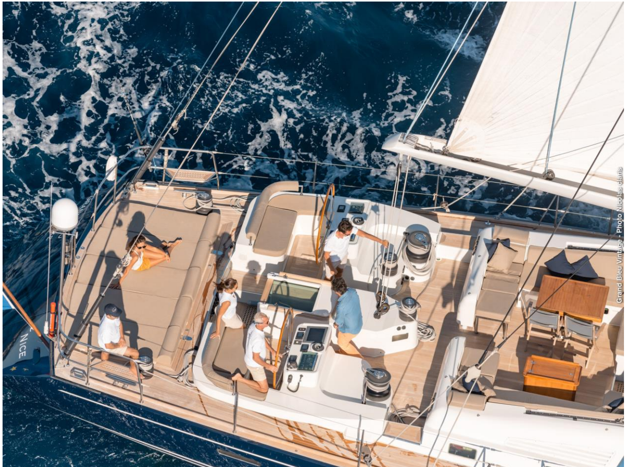
Grand Bleu Vintage