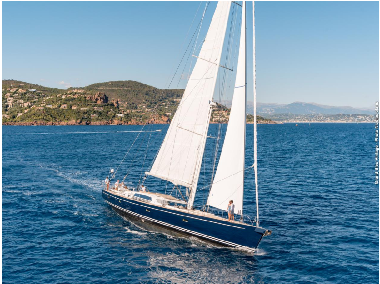
Grand Bleu Vintage