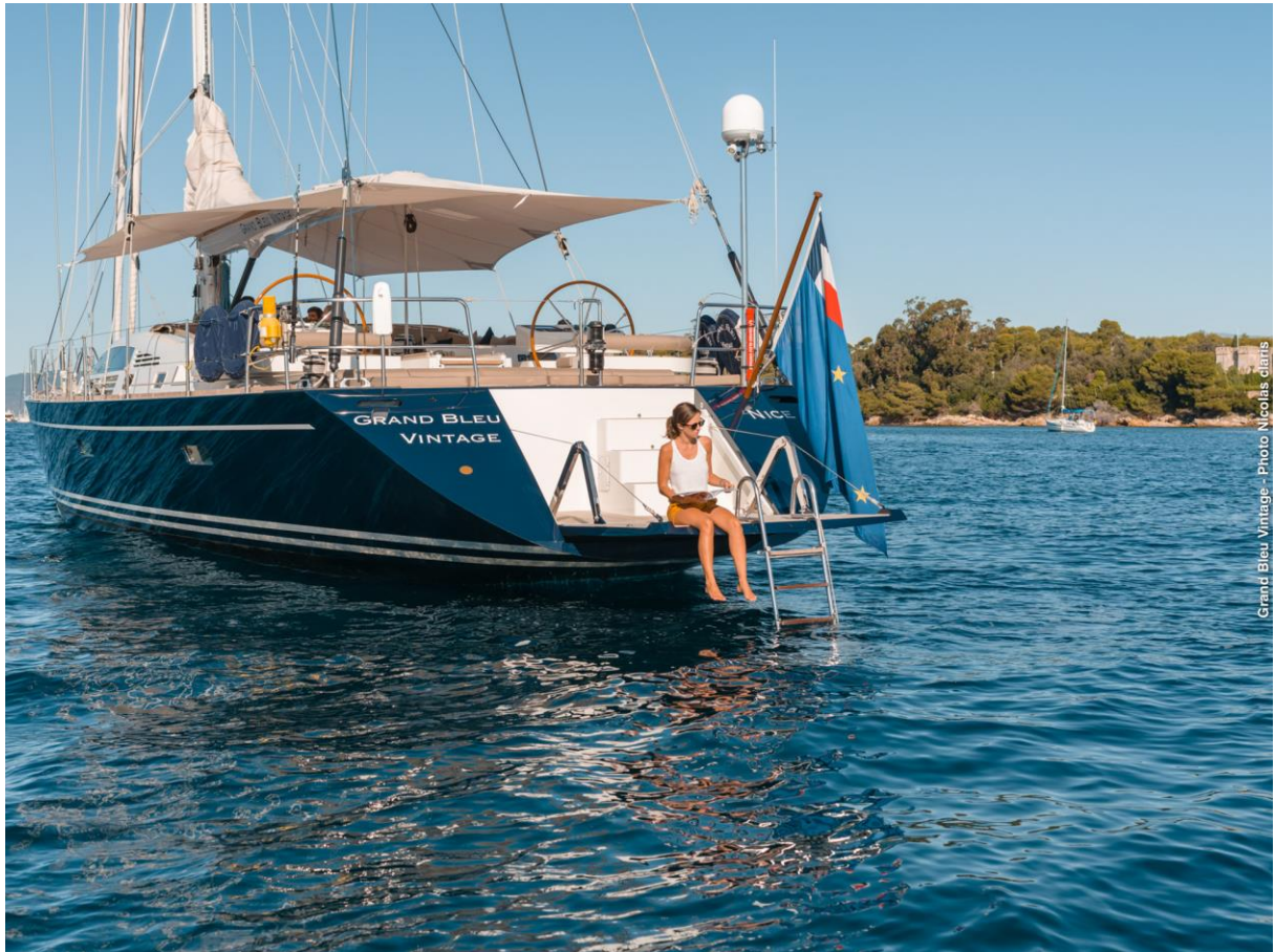
Grand Bleu Vintage