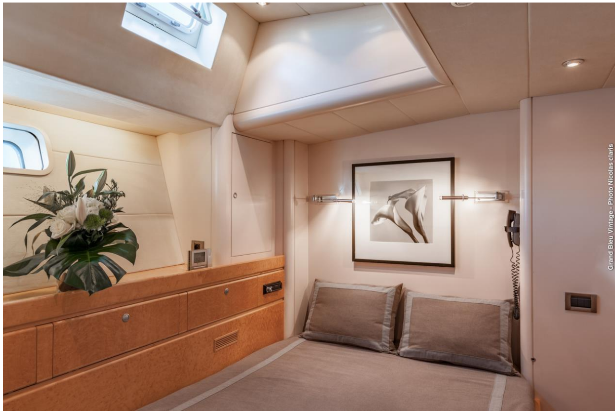
Grand Bleu Vintage