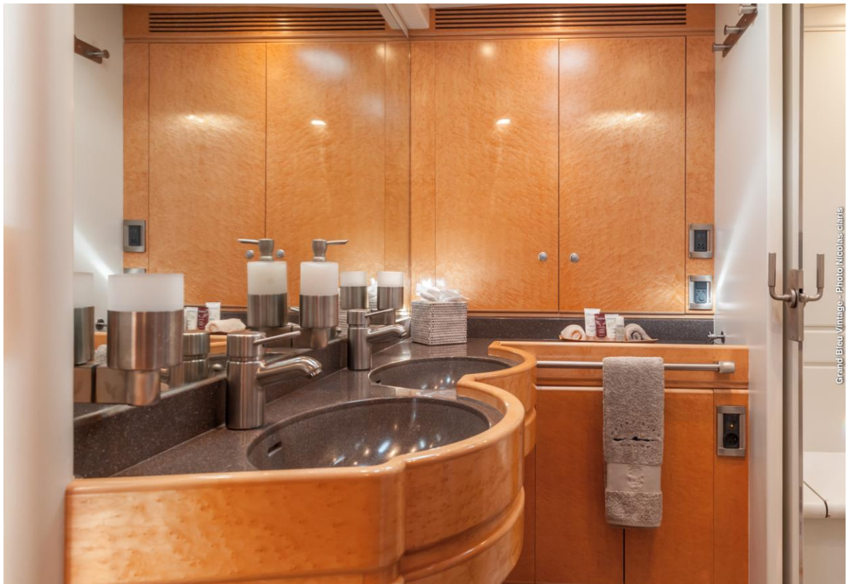
Grand Bleu Vintage