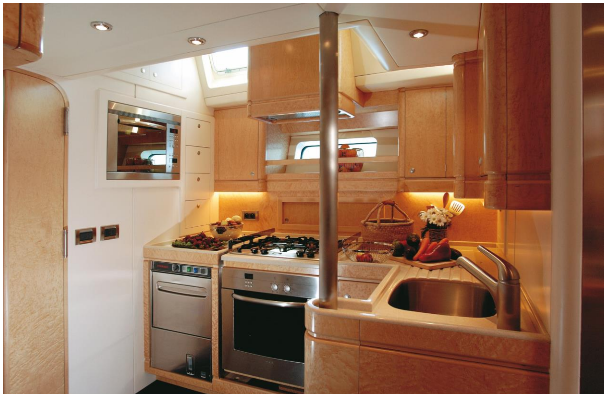
CNB - Grand Bleu Vintage