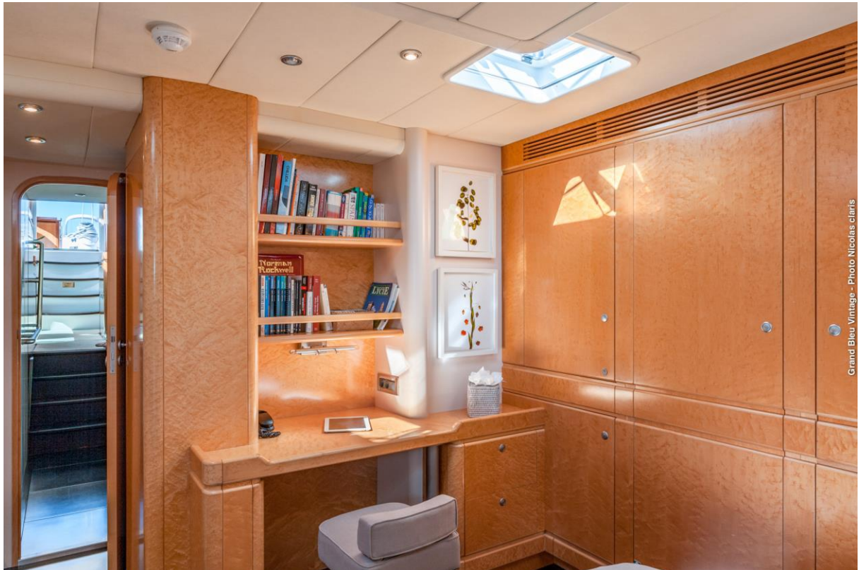
Grand Bleu Vintage