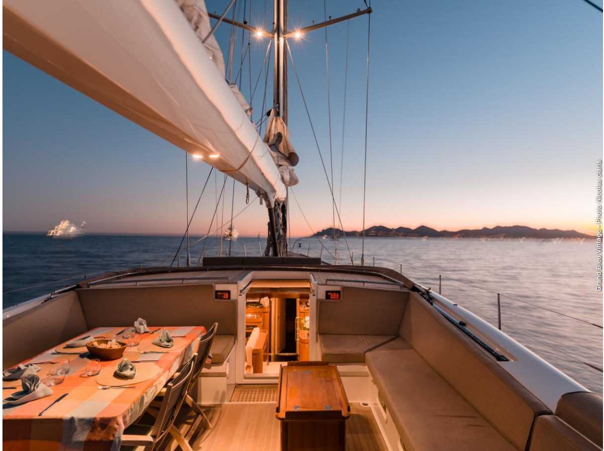
Grand Bleu Vintage