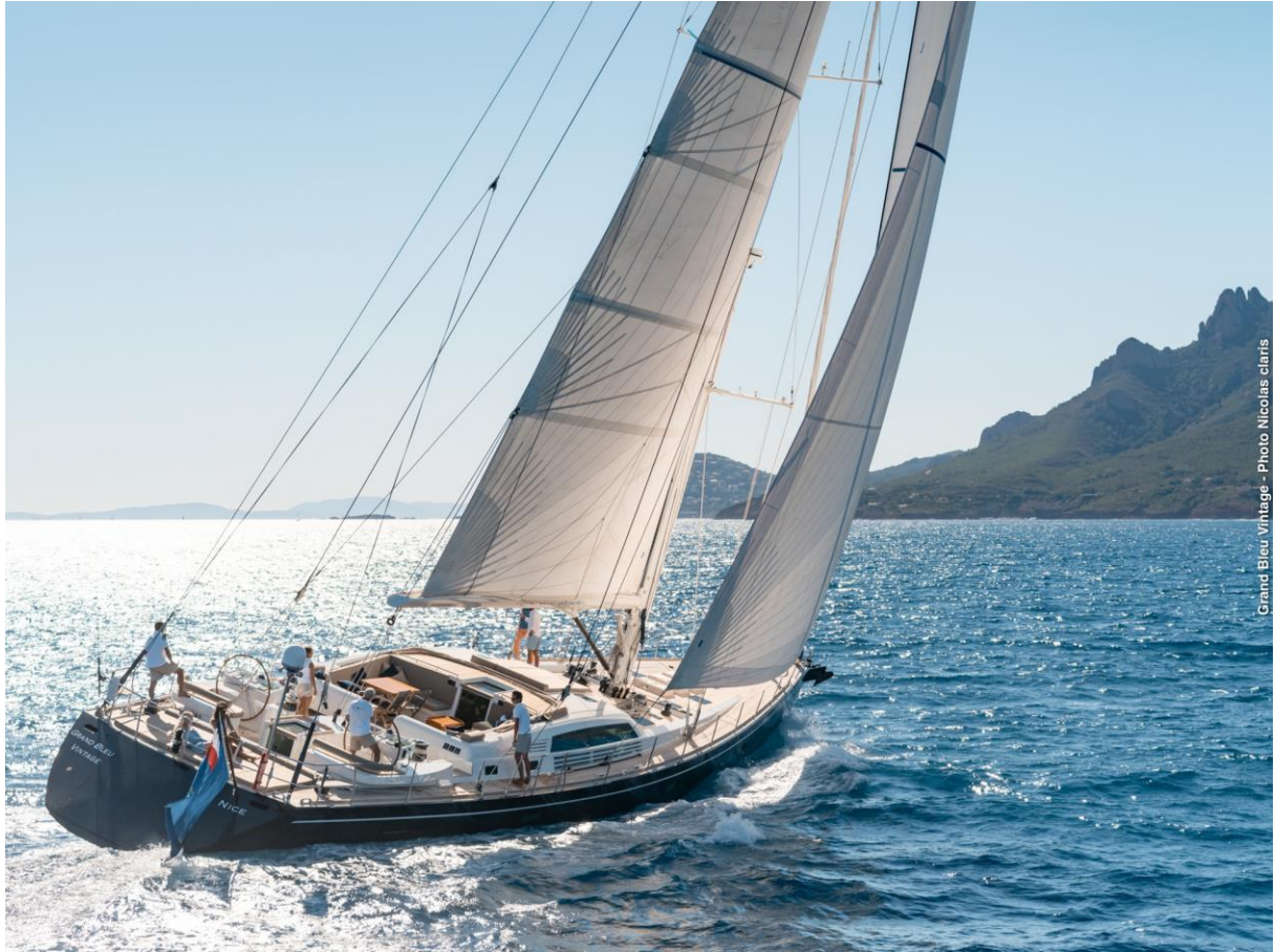
Grand Bleu Vintage