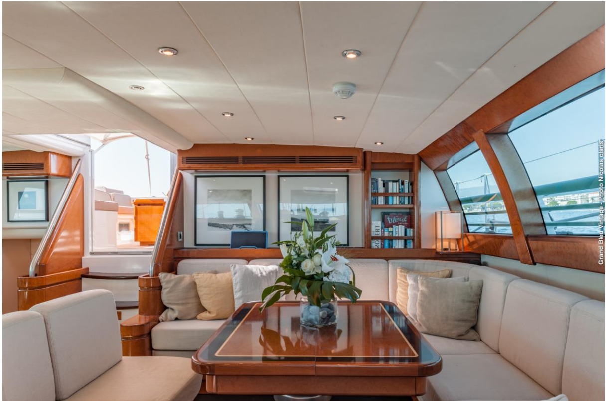
Grand Bleu Vintage