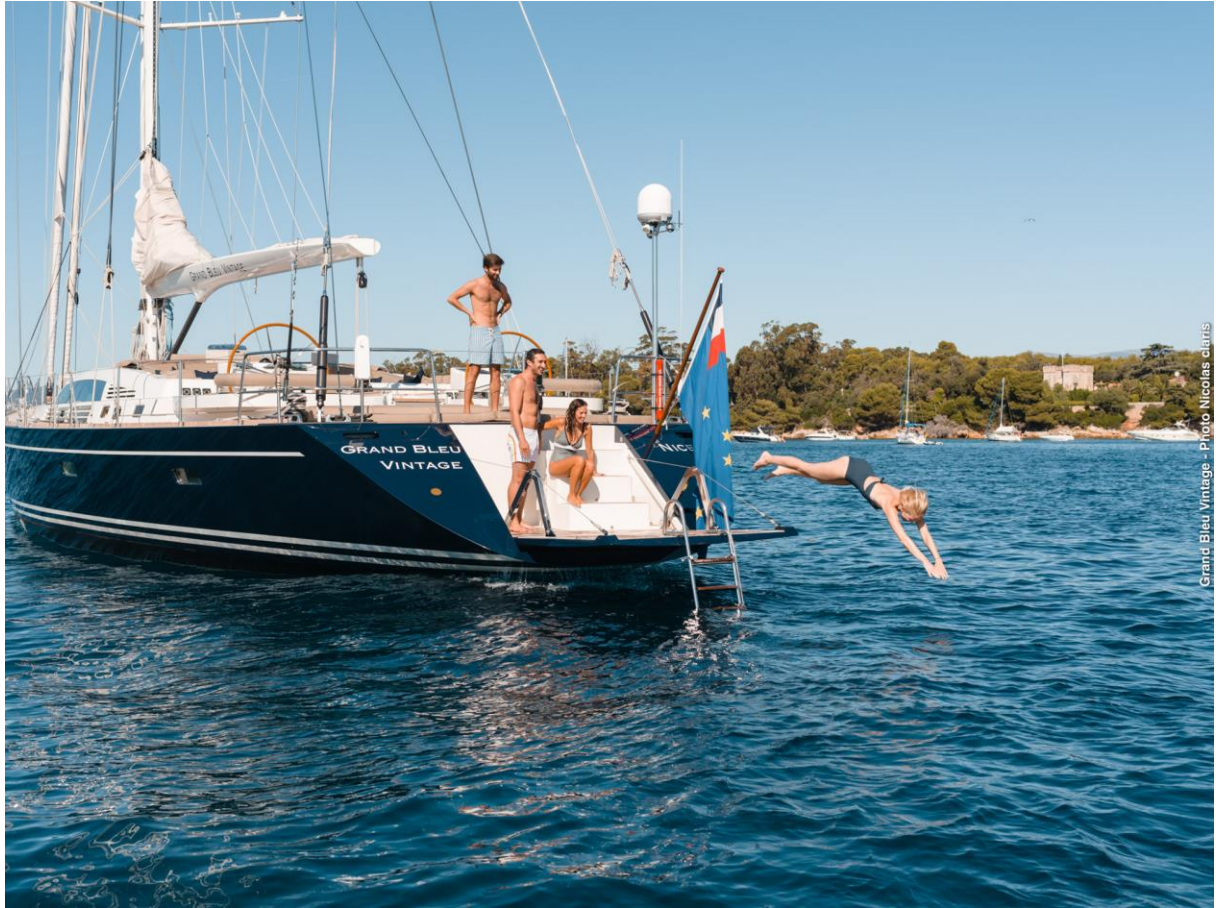
Grand Bleu Vintage