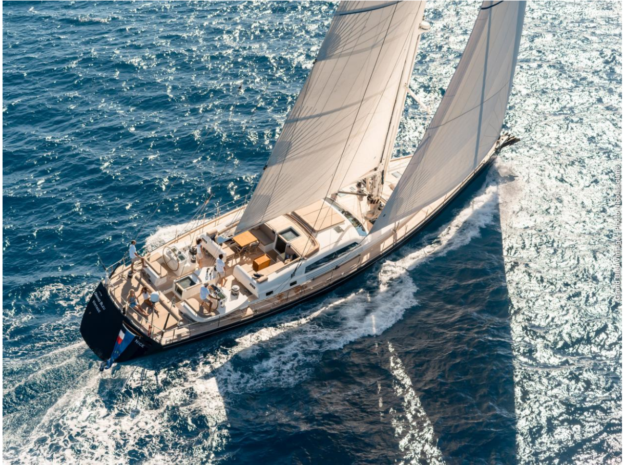
Grand Bleu Vintage