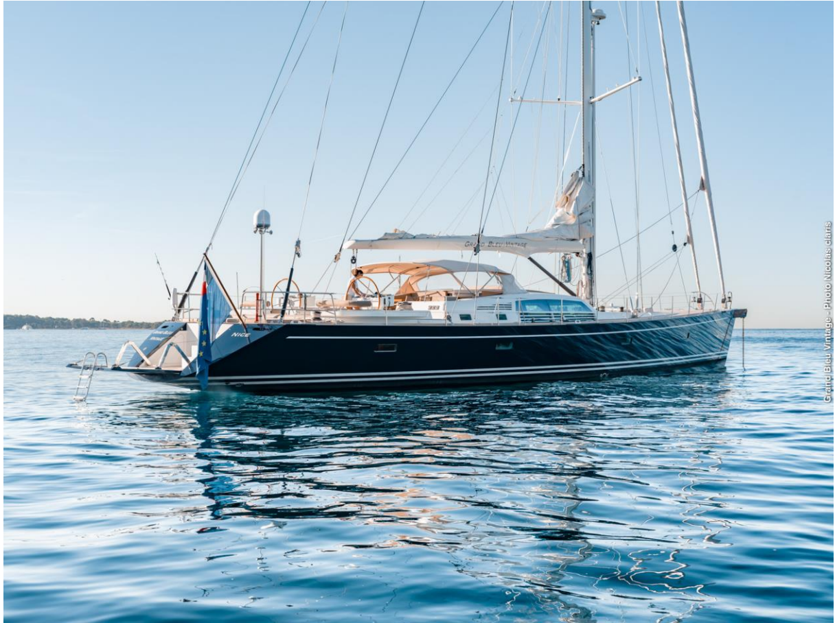
Grand Bleu Vintage