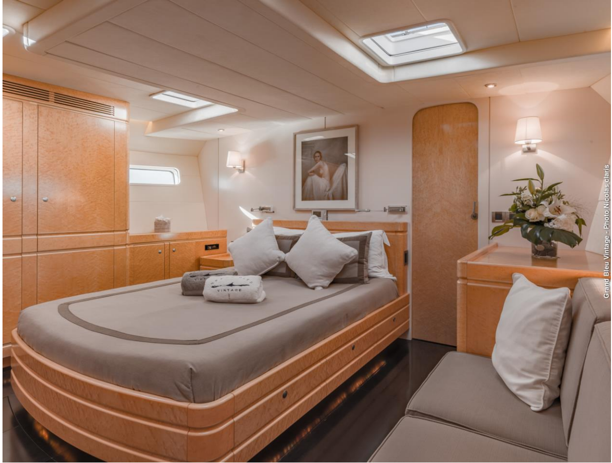
Grand Bleu Vintage